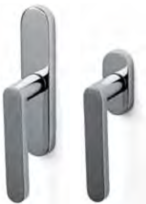
C200R - fixed window slider